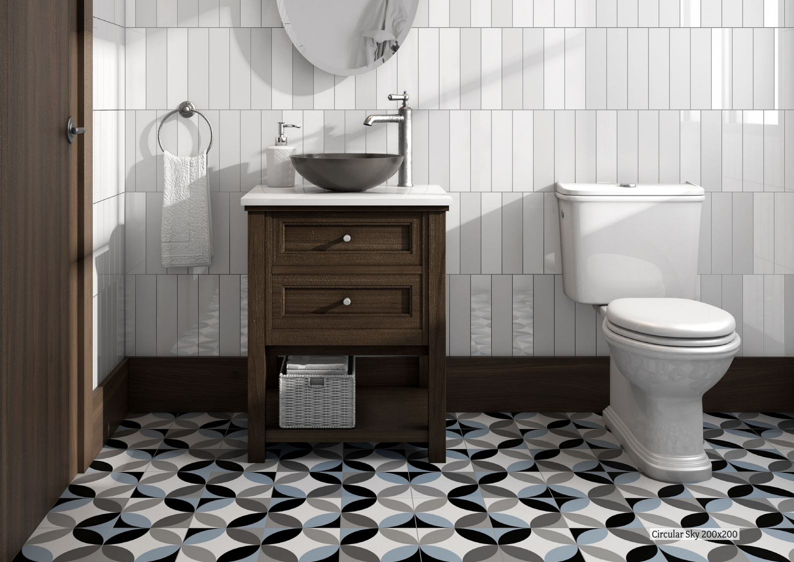
Circular Sky 200x200