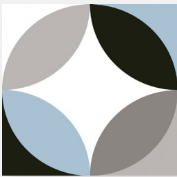
CIRCULAR SKY 200X200