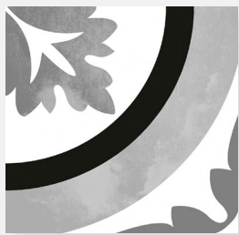
ORNAMENTAL BLACK&WHITE 200X200