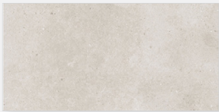
PATRONIC SILVER 300X600 PATSIL3060M - PATRONIC SILVER MATT