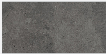
PATRONIC EBONY 300X600 PATEBO3060M - PATRONIC EBONY MATT