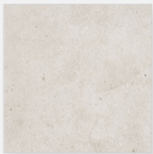
PATRONIC SILVER 300X300 PATSIL3030M - PATRONIC SILVER MATT