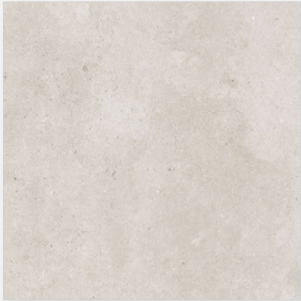
PATRONIC SILVER 600X600 PATSIL6060M - PATRONIC SILVER MATT