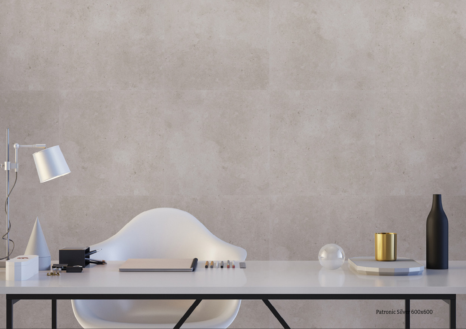
Patronic Silver 600x600